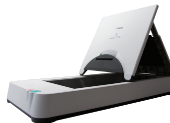
A4 Flatbed Scanner Unit 101