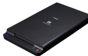
A4 Flatbed Scanner Unit 102

Scan bound books, journals and fragile media by adding the Flatbed Scanner Unit 102 for documents up to A4 or Flatbed Scanner Unit 201 for A3 scanning. Connected by USB, these flatbed scanners work seamlessly with the DR-C225 II (only) in a smooth dual-scanning operation that lets you apply the same image-enhancement features to any scan.