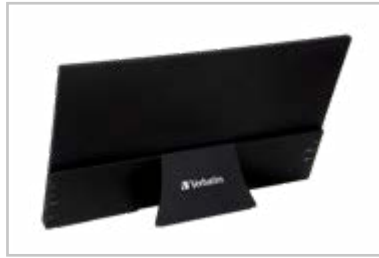
Back Right angled