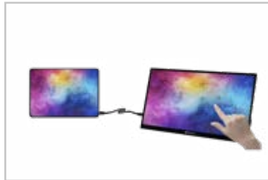
Monitor with tablet