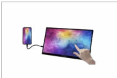
Monitor with smartphone