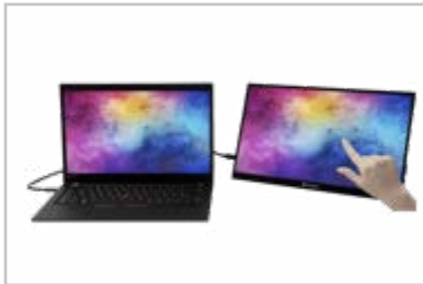
Monitor with laptop