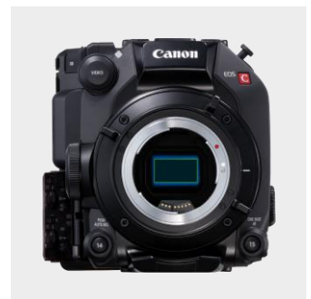
EOS C300 Mk III