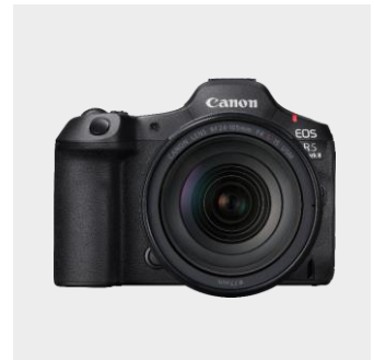
EOS R5 MARK II