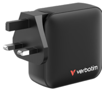
UK Type G