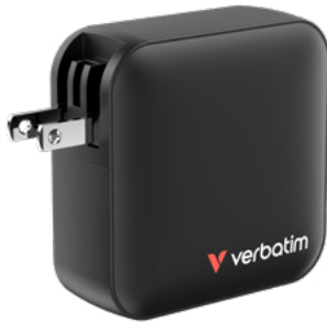
US Type A