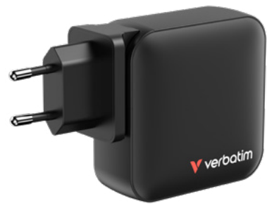
EU Type C