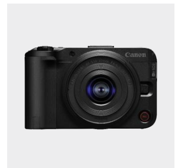
EOS R50 V